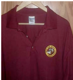
Golf shirt - $18.00 Maroon or white

Proud of your alma mater? Let people know by wearing one of our great shirts or hats!