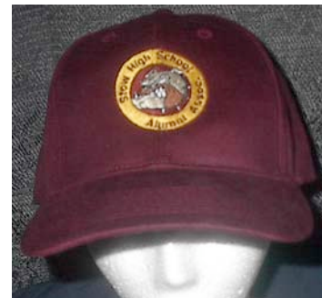
Ball Cap - $12.00

NOT PICTURED Hooded Sweatshirt - $25.00 Available in maroon, white or gray