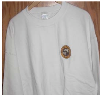
Sweatshirt - $20.00 Maroon, white or gray